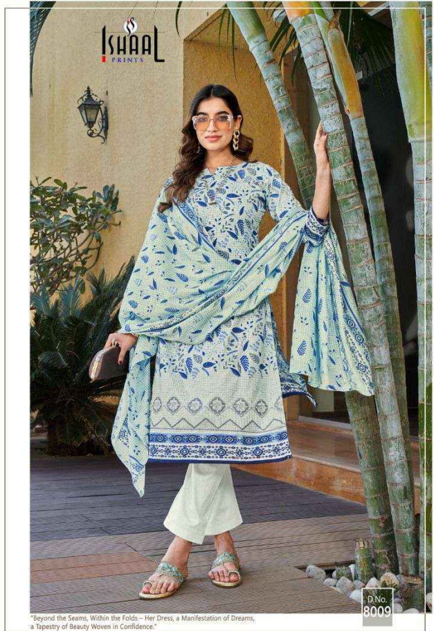
"Beyond the Seams, Within the Folds – Her Dress, a Manifestation of Dreams, a Tapestry of Beauty Woven in Confidence."