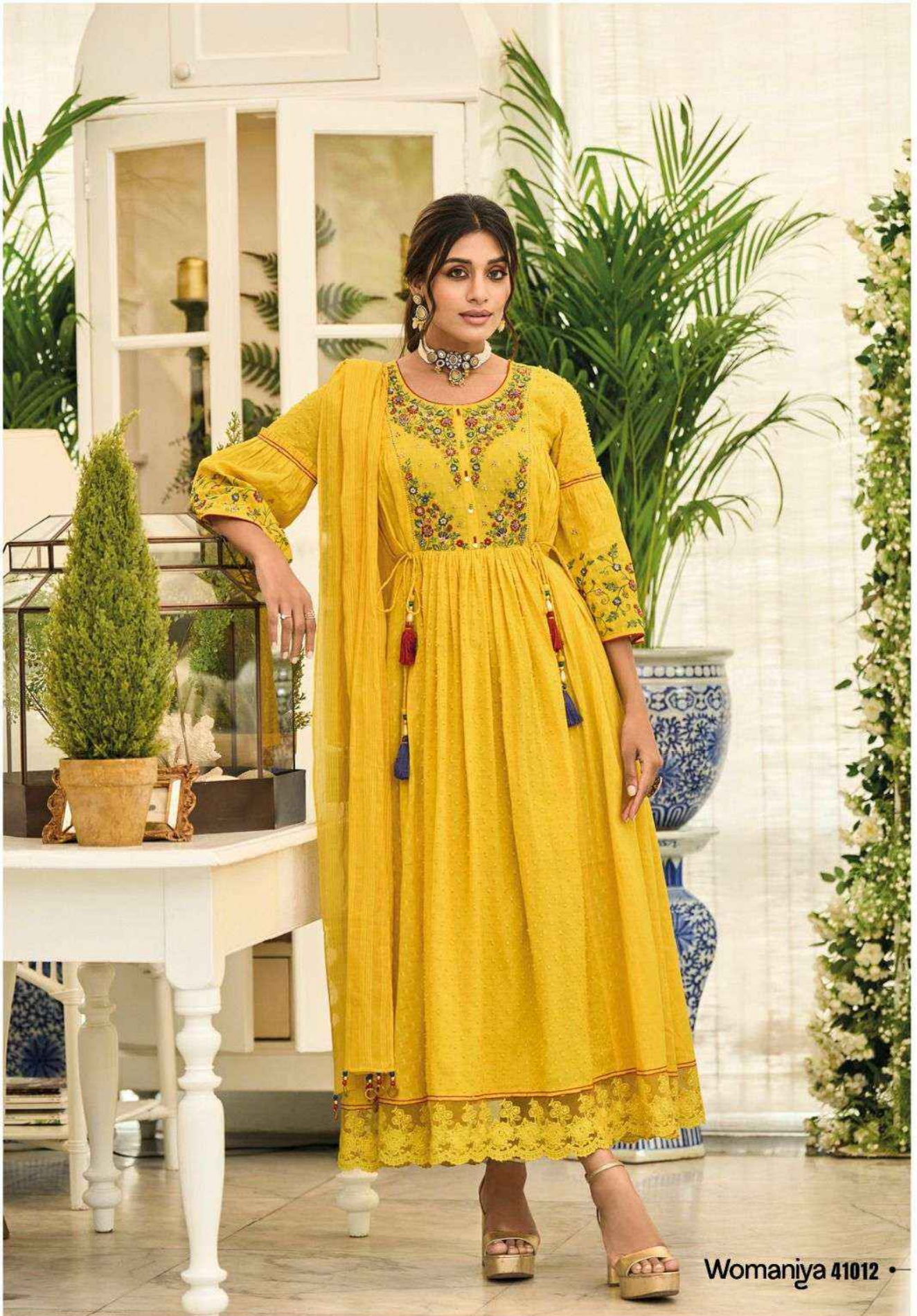
Womaniya 41012 •