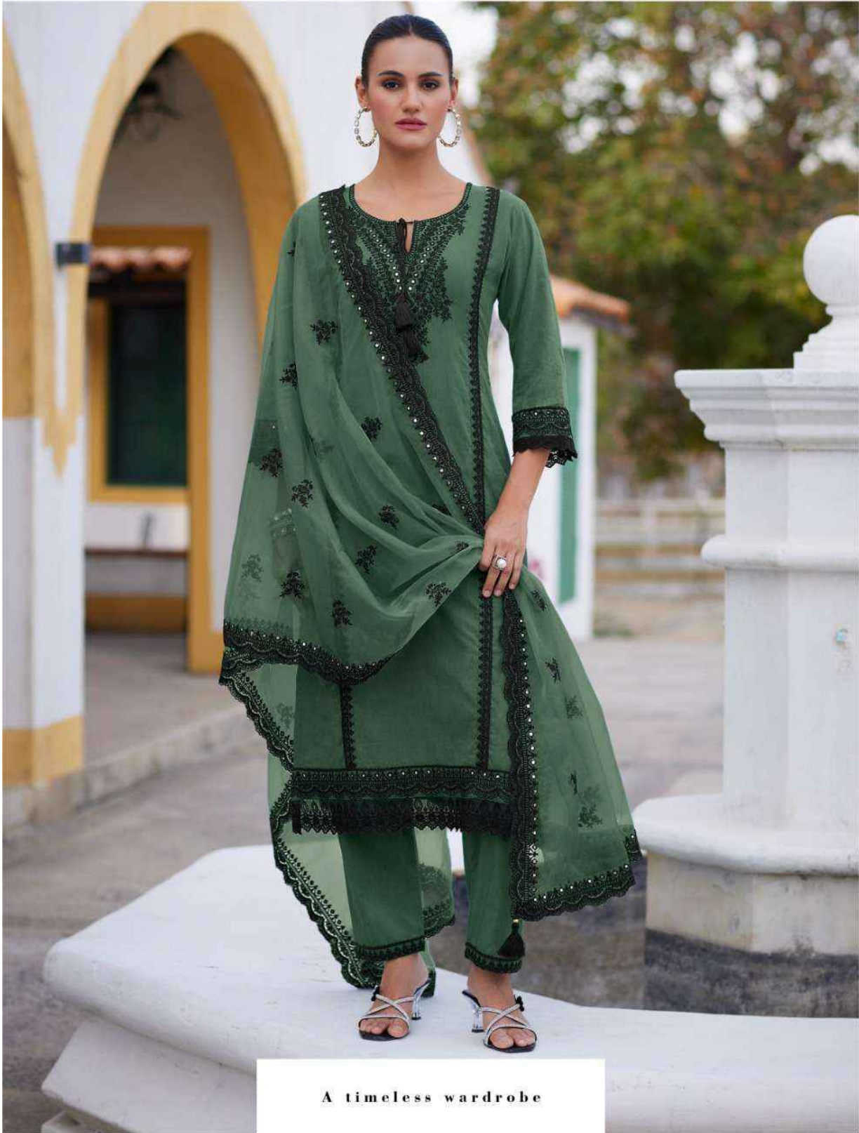
A timeless wardrobe