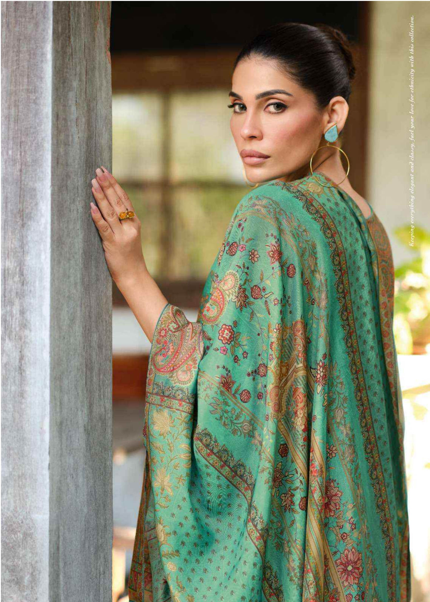
Keeping everything elegant and classy, feel your love for ethnicity with this collection.