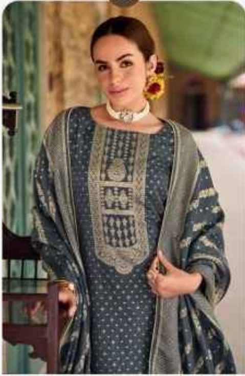
Inspired by history, designed for now. A modern silhouette with an ethnic soul. Fabric that flows like a river's song. To every thread, the heart that sings.