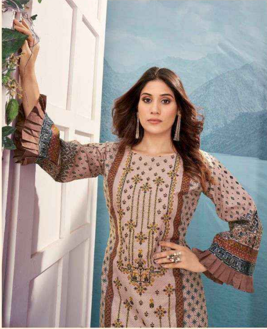
The way I dress depends on how I feel. I never have to psych myself up. Usually, it just feels like it works.