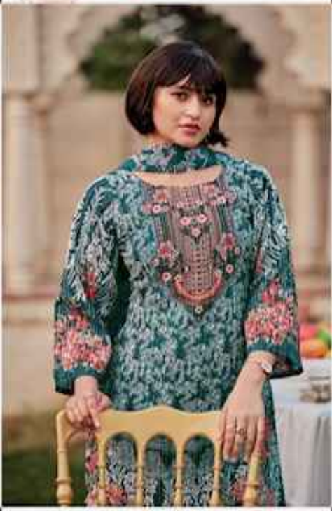
Get Your Saree Tall & Floral Too Code # 1000000