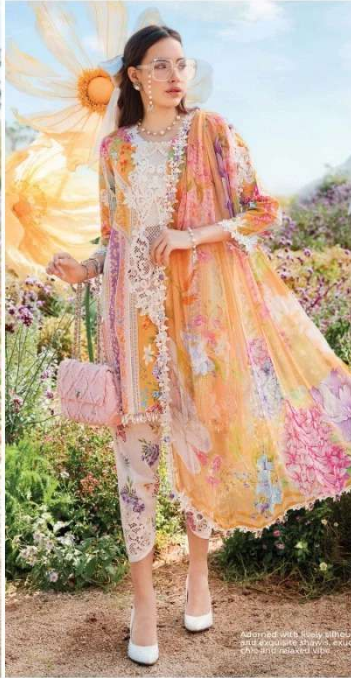
D NO 17003