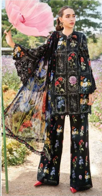
D NO 17002