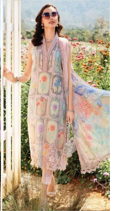
D NO 17004