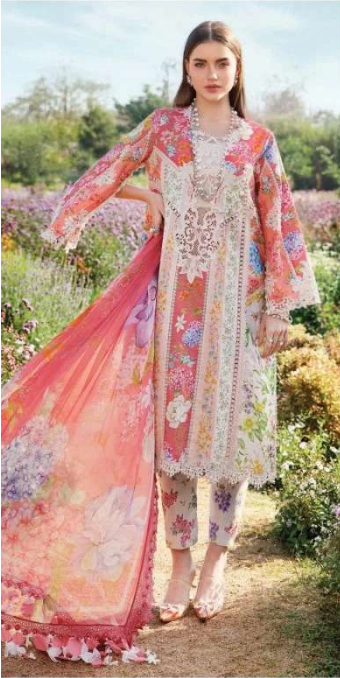
D NO 17001