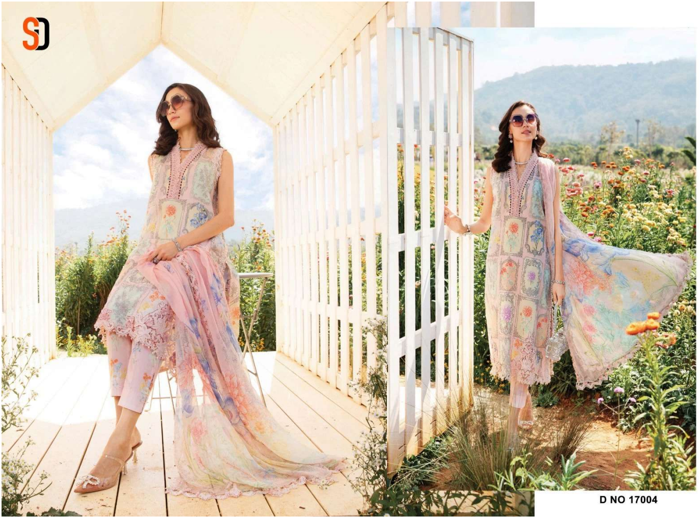
D NO 17004