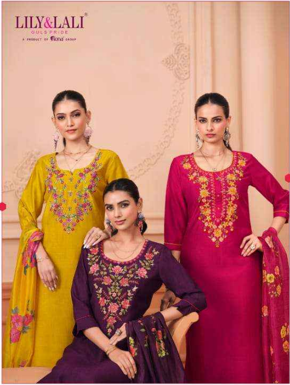
"Elegance is not standing out, but being remembered."