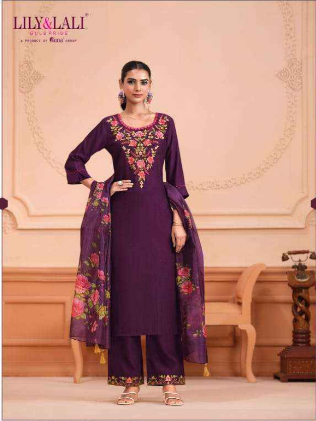
"Elegance is not standing out, but being remembered."