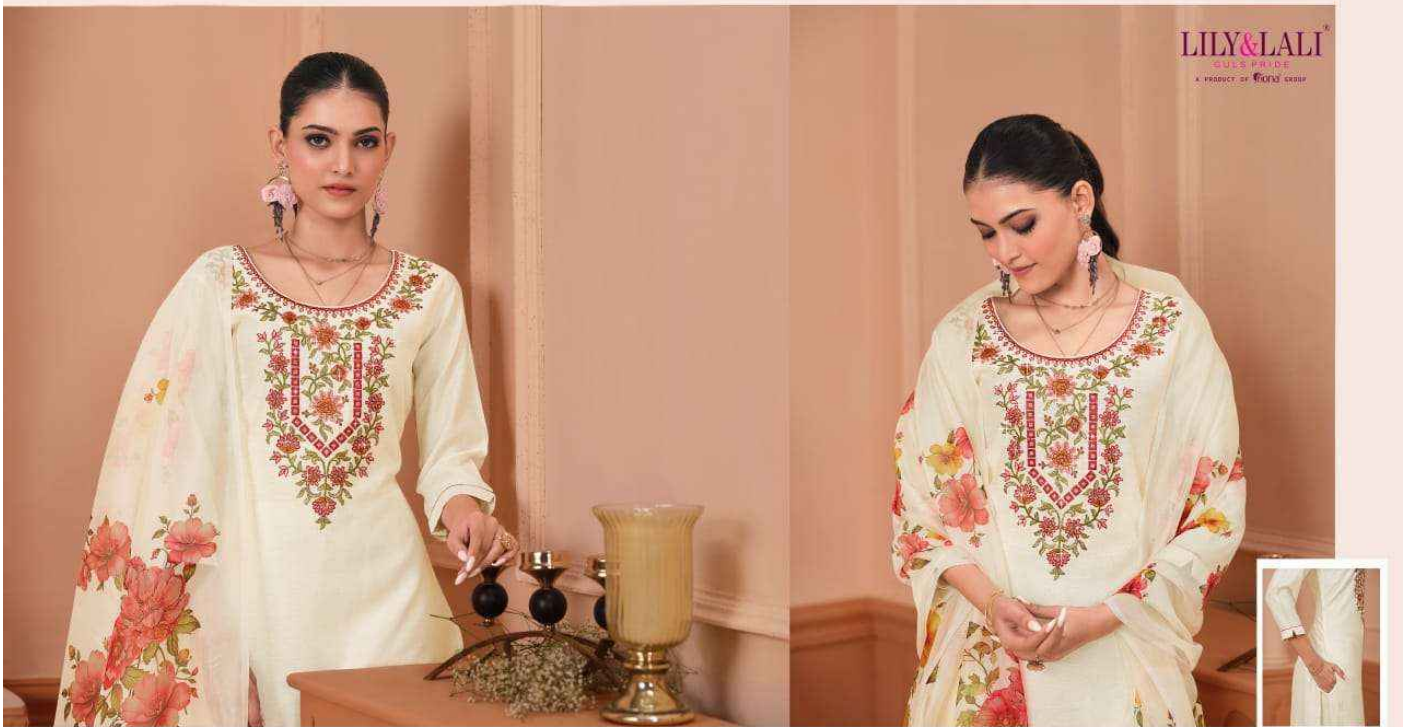
"Elegance is not standing out, but being remembered."