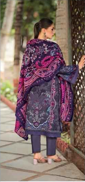
سبز و سیاہ | 27007