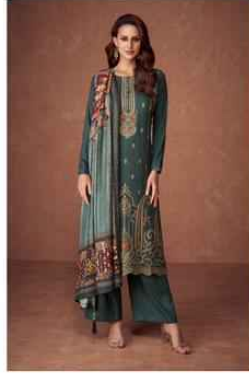
TABRIZ - 81002