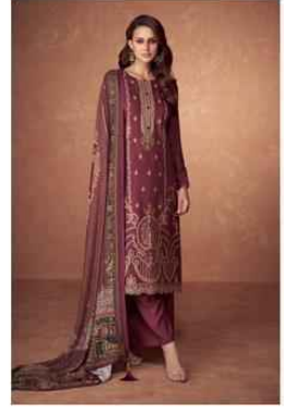
TABRIZ - 81006