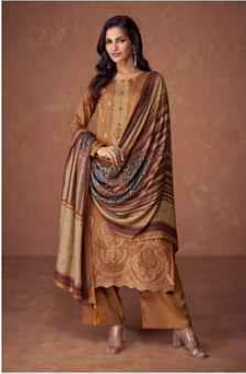
TABRIZ - 81003