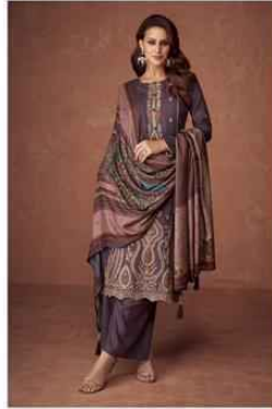
TABRIZ - 81004

منتان آرٹس Muntaz Arts Regency de Luxe THE TABRIZ COLLECTION