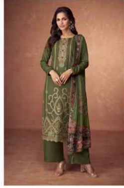
TABRIZ - 81005