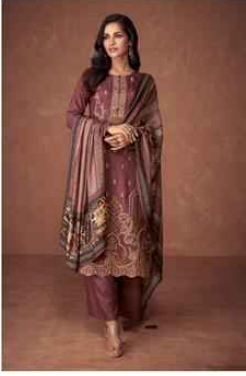
TABRIZ - 81001