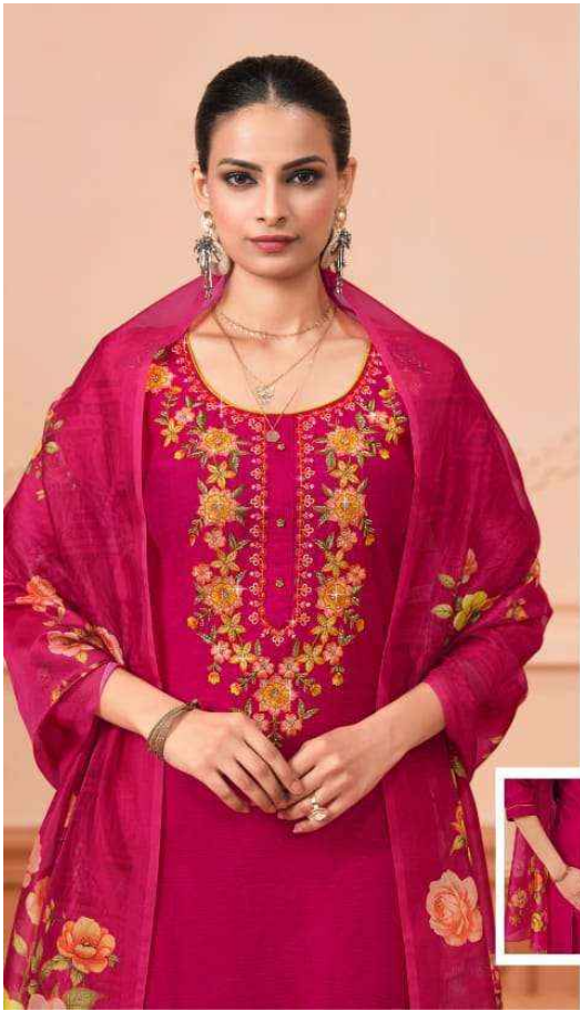
"Quadrangle is not standing out, but being remembered." 25302