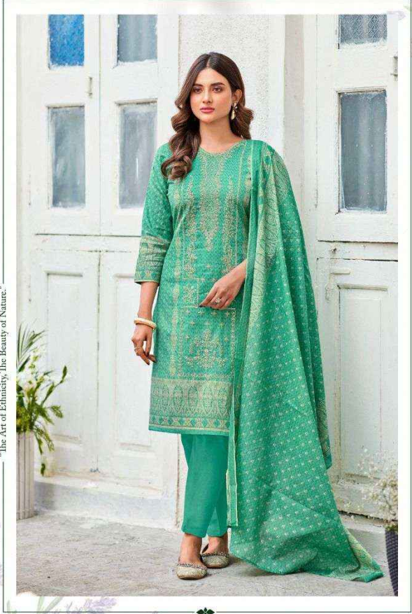
"The Art of Ethnicity, The Beauty of Nature."