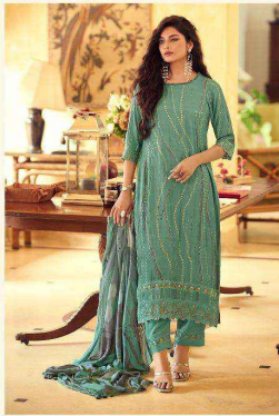
92 / 63