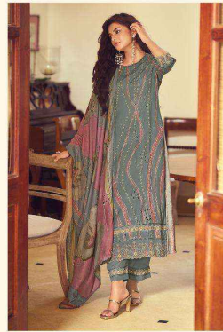
92 / 67