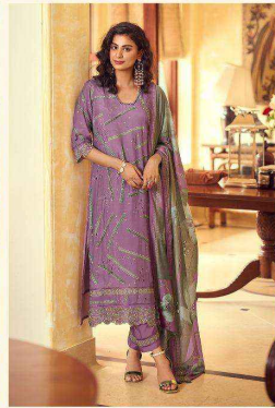
92 / 64