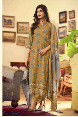
92 / 62