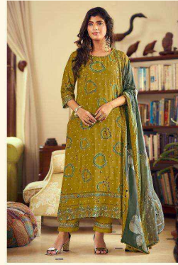
92 / 65