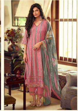
92 / 66