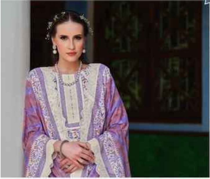
© Zulfat is a registered trademark of Zulfat Fashion and Accessories. All rights reserved. For more information, visit www.zulfat.com