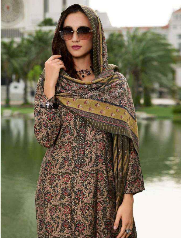
The colours of earth, orange and green, are as soothing as they are luminous. Add a understated radiance to your day with this dress. D.no.15672