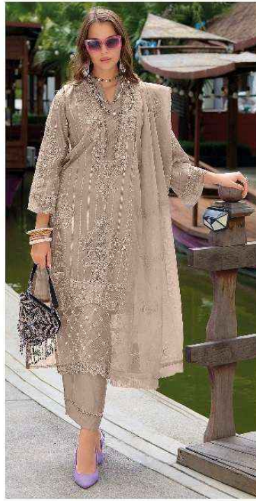
C - 1922 B

Rosemeen ® Styled for your comfort by Fepic