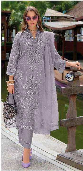
C - 1922