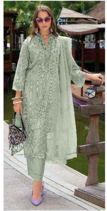
C - 1922 C

Rosemeen ® Styled for your comfort by Fepic