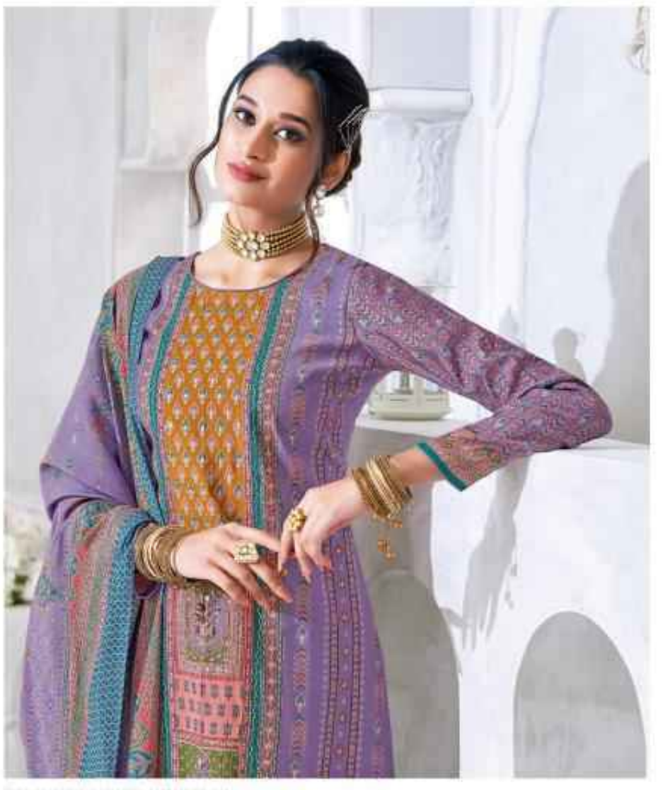
Model: 25/07/2023 10:00:00 AM Model: 25/07/2023 10:00:00 AM Model: 25/07/2023 10:00:00 AM