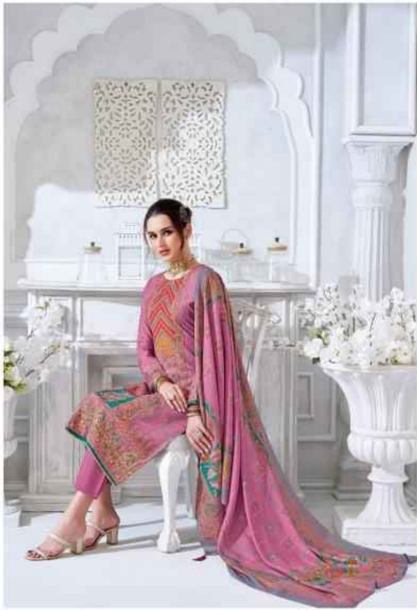
જી.કે.સાહુભાઈ (પ્રાઈવેટ) લિમિટેડ ગ્રાહકોને સુવર્ણ જીવન આપવાનો હેતુ ધરાવે છે. અમારું લક્ષ્ય છે કે અમારા ગ્રાહકોને સુવર્ણ જીવન આપવામાં સક્ષમ બને.