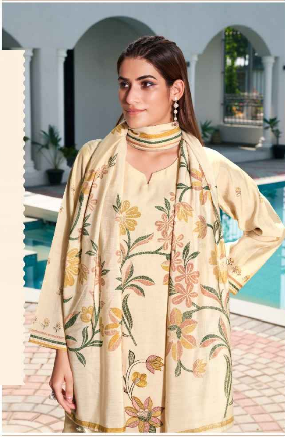
AARZOO • 3003 •

Stop by for a look at your comfortable design and delicate embellishments.