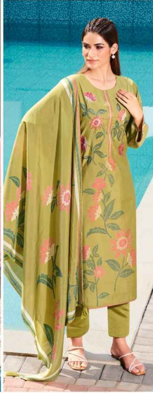
•3002• ■■■■ AARZOO