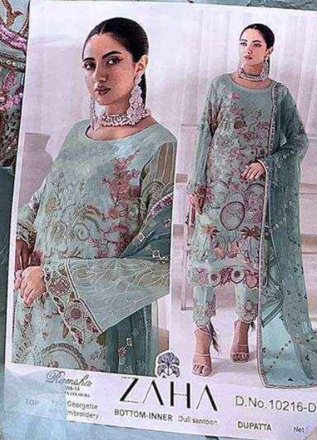
Promade No. 112 PROMADE TOP: Fabric: Georgette Embroidery ZAHA D.No. 10216-D BOTTOM-INNER: Dull santoon DUPATTA: Net