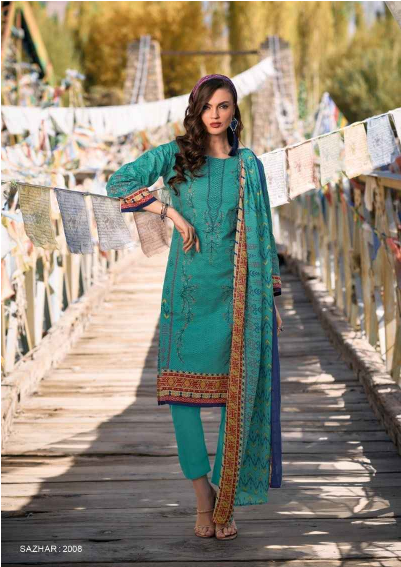
SAZHAR : 2008