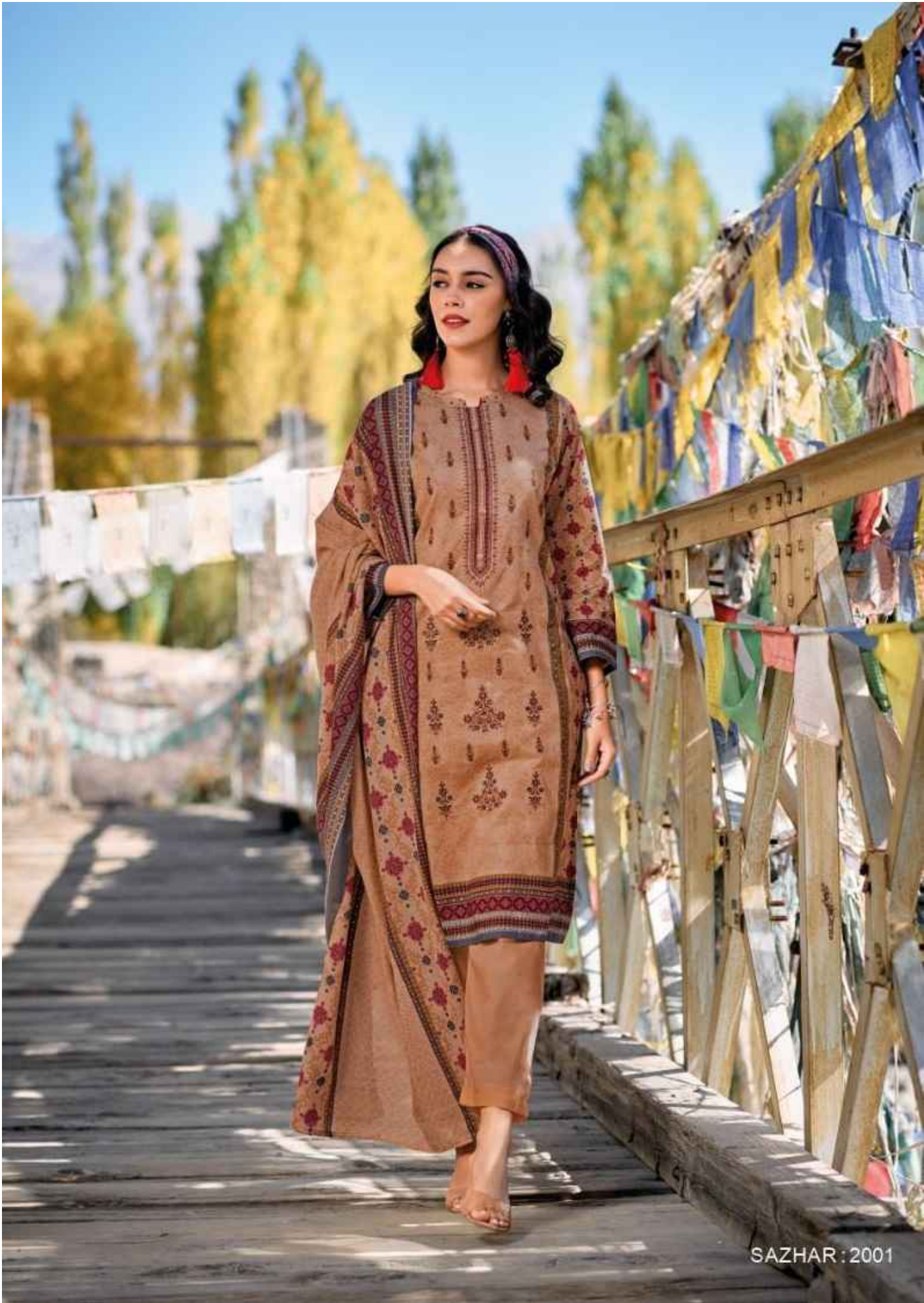
SAZHAR : 2001