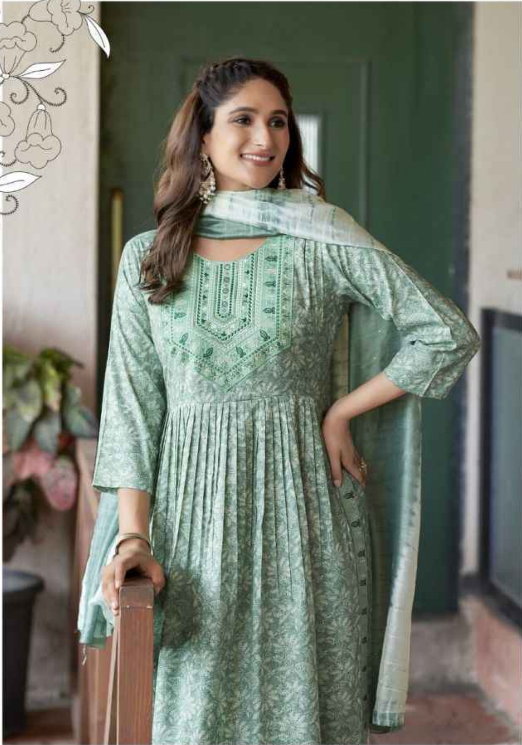
Indian Fashion Salwar Kameez and Kurtis are all the way comfortable yet elegant and easy to wear. Designer Kurtis, Salwar Kameez and Churidar are the latest trend in Indian fashion, some are embellished with gorgeous embroidery work in pleasing designs, they manage to look smart enough to be worn for casual family gatherings, or even for a wedding ceremony.