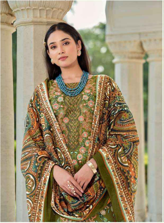
970-007 "What you wear is how you present yourself to the world, especially today, when human contacts are so quick. Fashion is instant language."