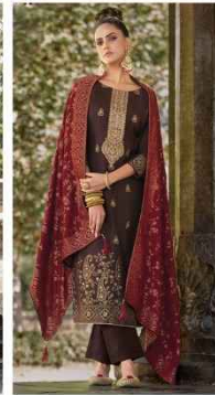
830-002 ■ ■ ■