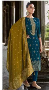
830-001 ■ ■ ■