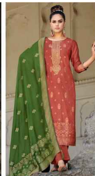
830-005 ■ ■ ■