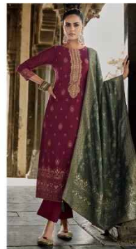
830-004 ■ ■ ■