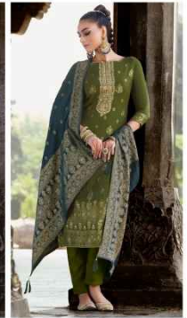
830-003 ■ ■ ■