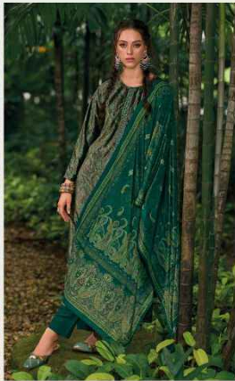
• 544 •