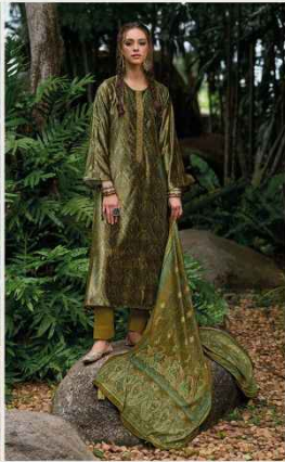
• 542 •