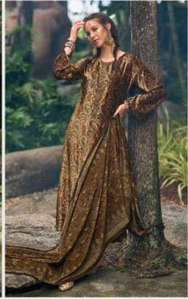
• 548 •