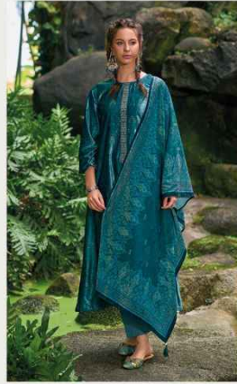
• 547 •