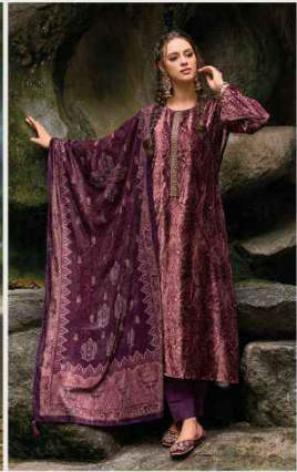
• 546 •