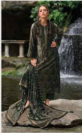
• 541 •