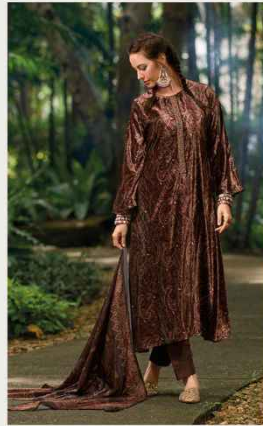
• 545 •