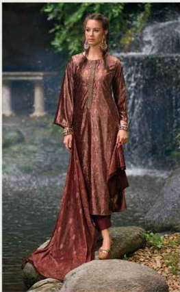
• 543 •