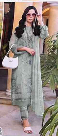
KHUSHBU ZAHA D.No.10151 DUPATTA Nazmin Chiffon with Embroidery