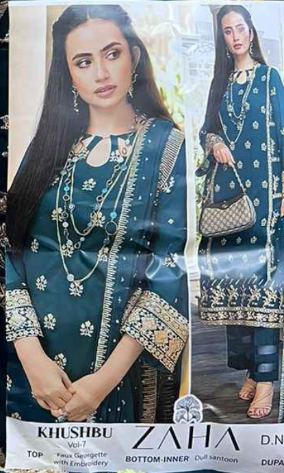
KHUSHBU Vol-7 TOP: Faux Georgette with Embroidery ZAHA D.N BOTTOM-INNER: Dull santoon DUPA