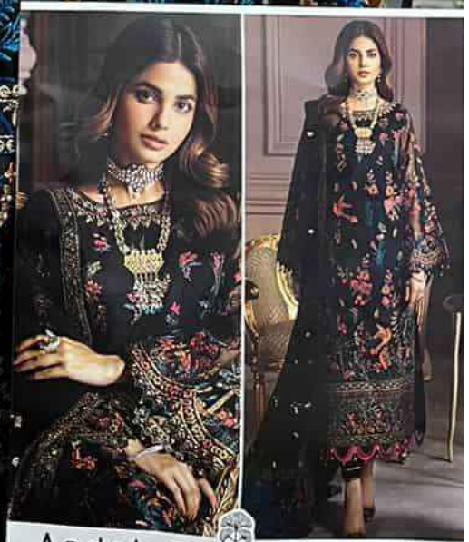
Aadab ZAHΛ D.No.10205 Vol-1 TOP Faux Georgette with Embroidery BOTTOM-INNER Duff Santoun DUPATA Nazmi with Embroidery