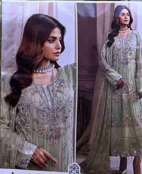
Aadab ZAHRA D.No.10204 Vol-1 TOP: Faux Georgette with Embroidery BOTTOM-INNER: DUPATTA: Nazmin with Embroidery