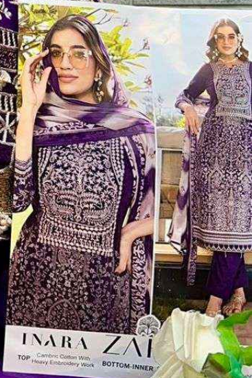
INARA ZAI TOP: Cambric Cotton Weft, Heavy Embroidery Work BOTTOM: INNER