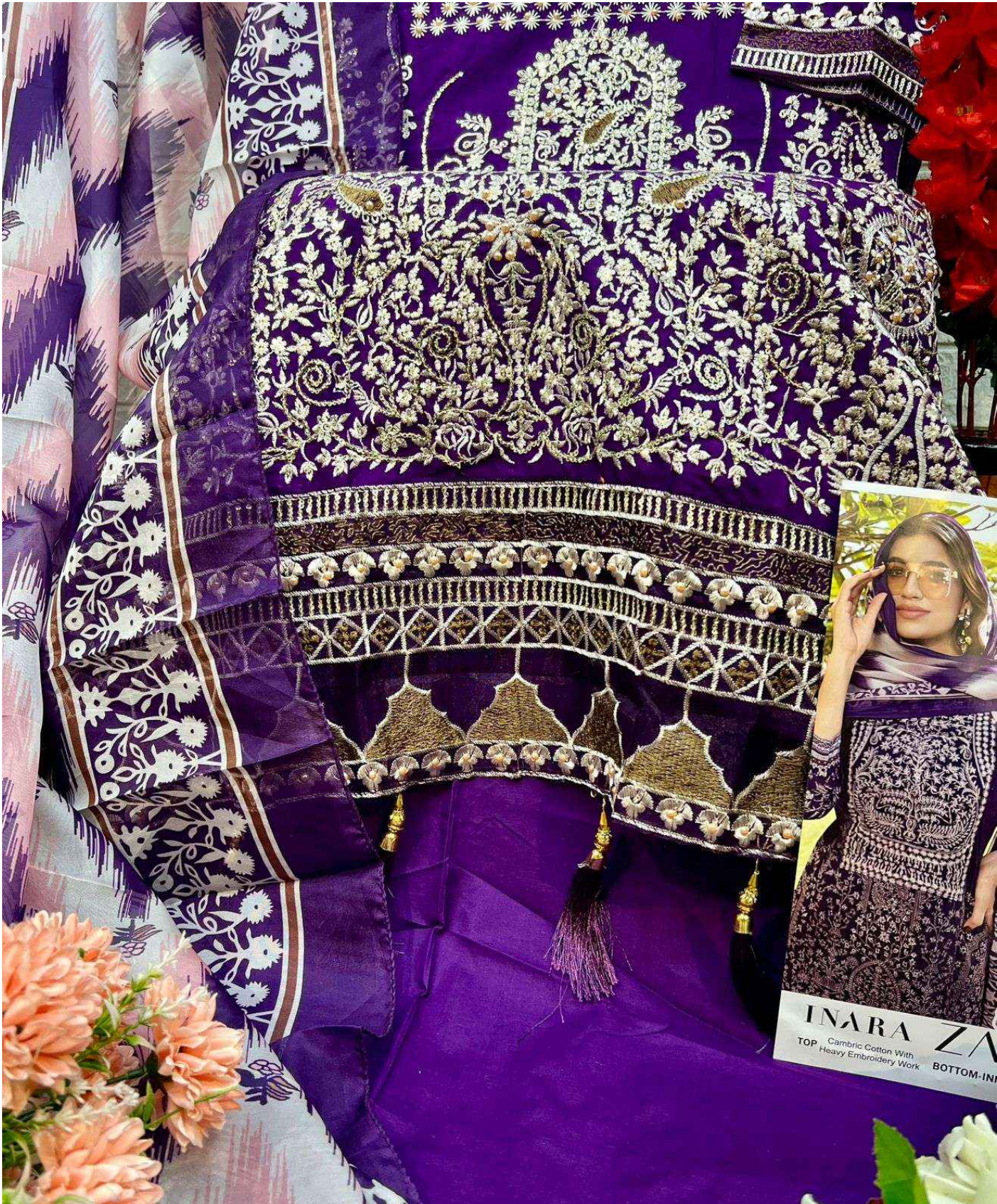
INARA ZA TOP Cambric Cotton With Heavy Embroidery Work BOTTOM-INI