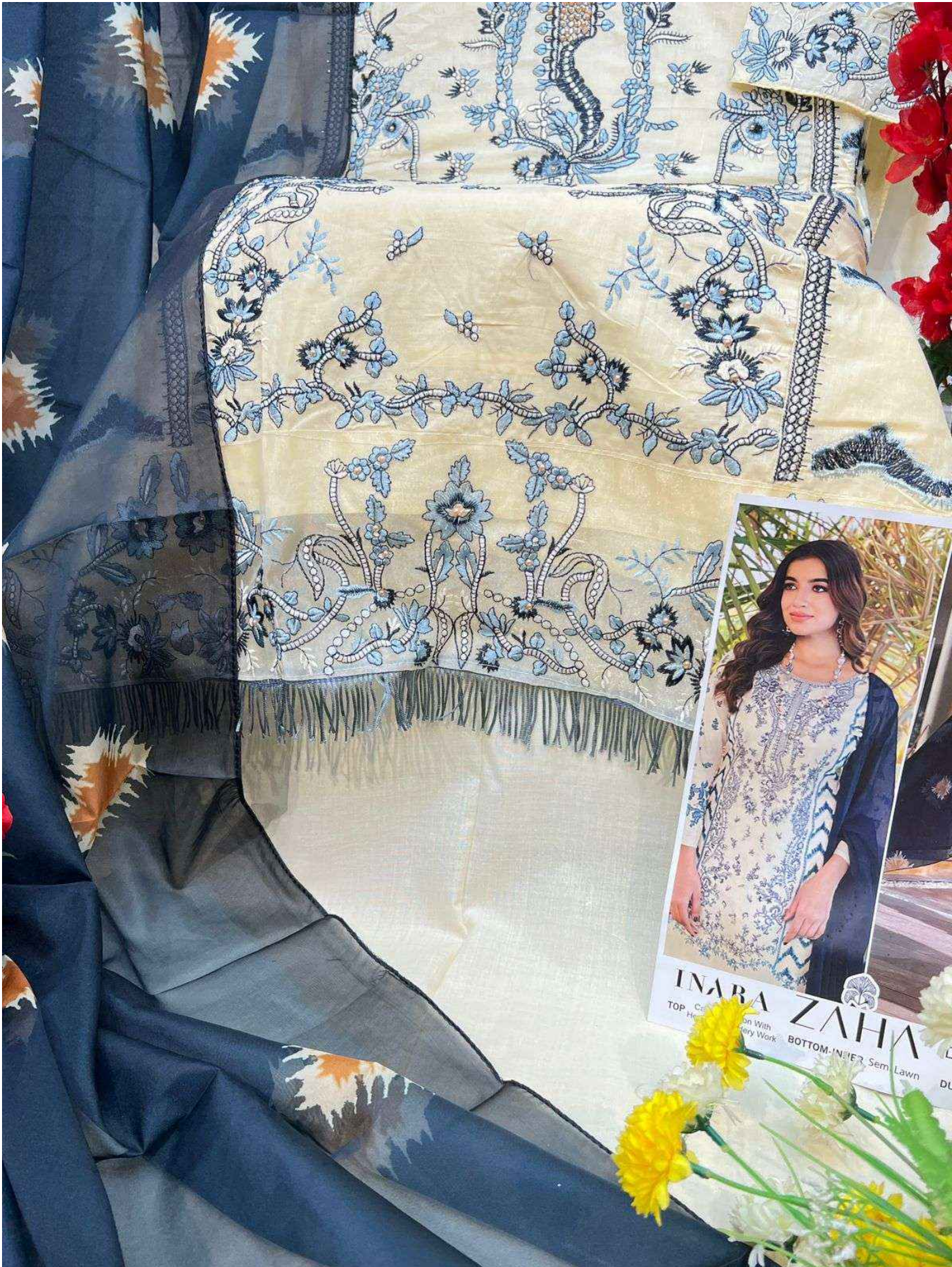
INABA ZAHHA TOP: Cream with Blue and Black Embroidery Work BOTTOM: INABA ZAHHA Sem Lawn