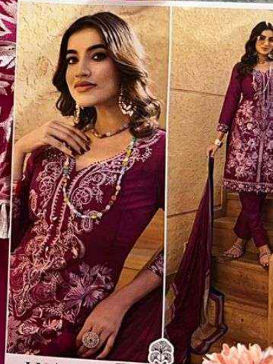
INARA ZAHIA TOP Cambric Cotton With Heavy Embroidery Work