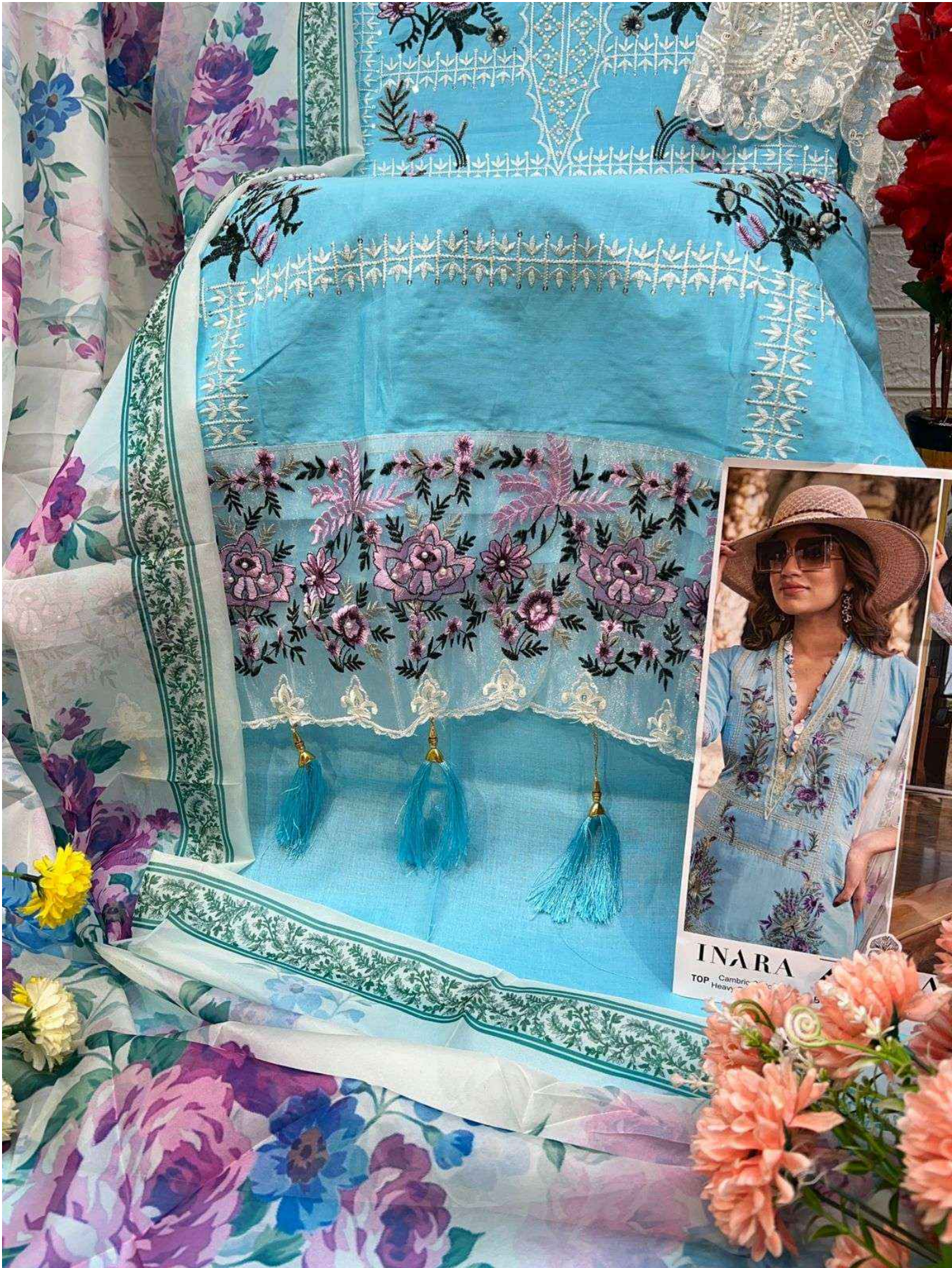
INARA TOP Cambric Heavy