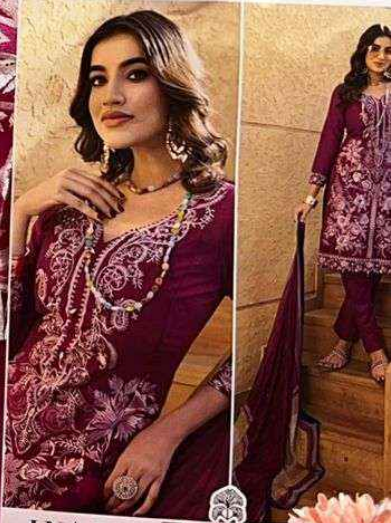
INARA ZAHIA TOP - Cambric Cotton With Heavy Embroidery Work 80