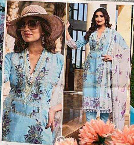
INARA Z TOP Cambic C Heavy