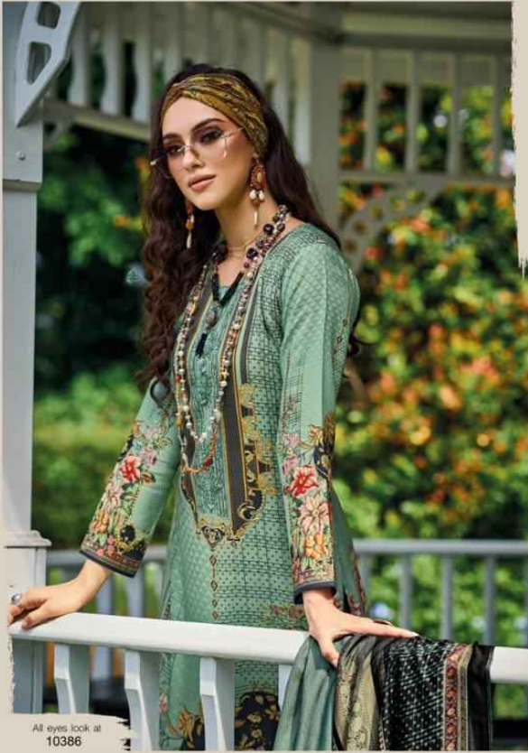
All eyes look at 10386