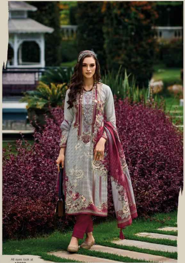
All eyes look at 10383