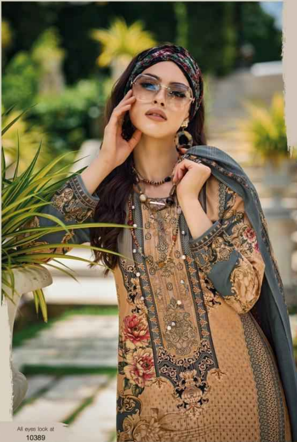
All eyes lock at 10389