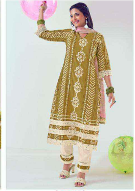
| 9036 |