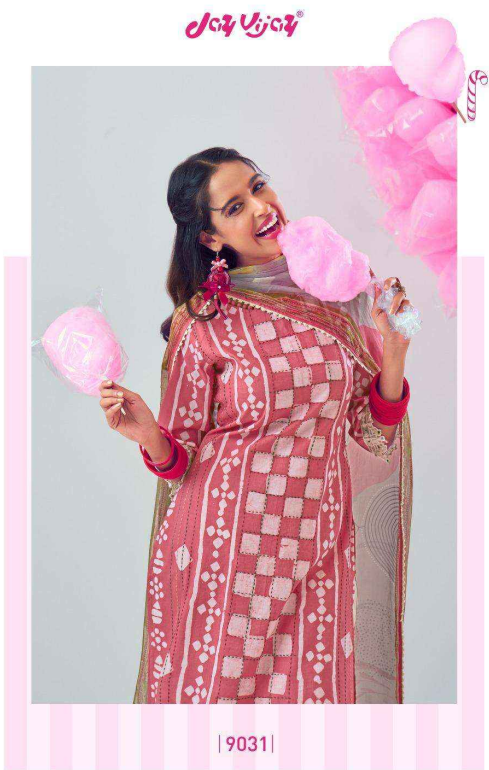
Classic styles with luxurious soft fabrics are highlighted by refined and feminine details