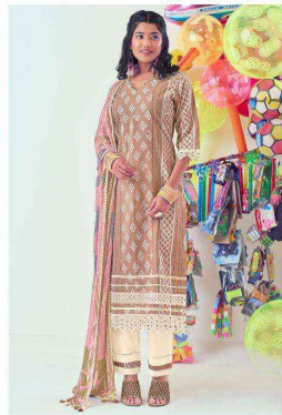
| 9034 |