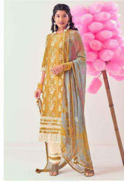
| 9032 |