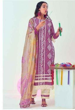
| 9035 |