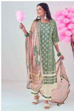
| 9033 |