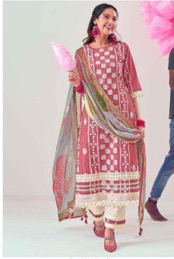
| 9031 |