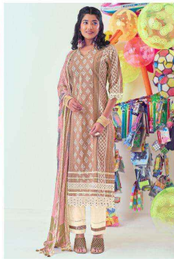
| 9034 |