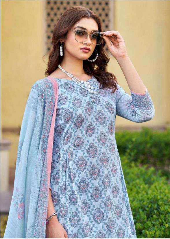
Just as wine ages with care, dresses need meticulous crafting and premium fabrics to express their excellence.

Owning Your Components, Be Your Own Muse