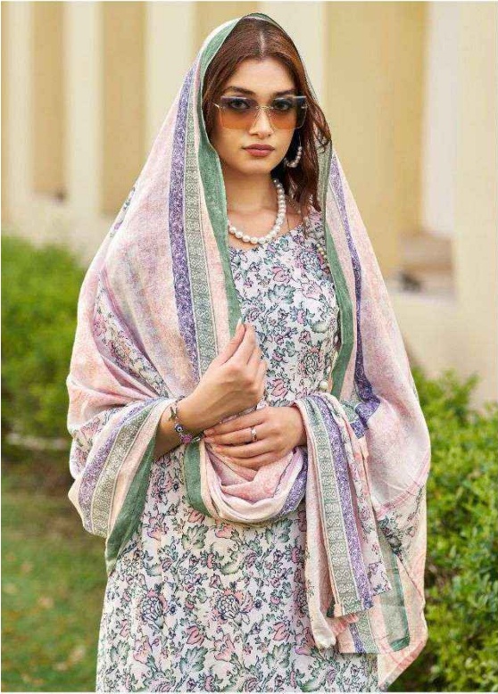
"Where Confidence Meets Glamour, You're Always Gorgeous."