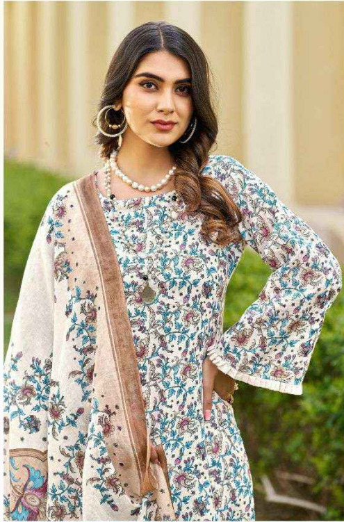
Dresses, resembling wine, require expert craftsmanship and the use of the finest fabrics to reveal their quality.